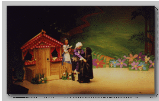
Fairy Tales in Traralgon – Grey Street PS

THIS A PREVIEW SCRIPT AND CAN ONLY BE USED FOR PERUSAL PURPOSES. THE COMPLETE SCRIPT AND SCORE ARE AVAILABLE FROM FOX PLAYS