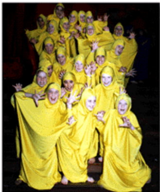
Star of the Sea College

Thank you for GERMS. The students were able to show great resourcefulness for costume and setting inspired by your musical and entertained young local primary school children immensely in their two free performances. Thanks for the great play Charles Sturt University