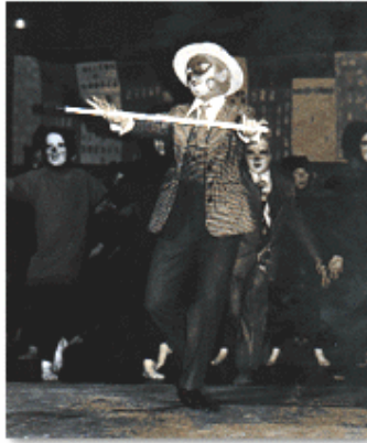
Rat Race Timboon P-12 School

A memorable occasion for the children Glenhuntly PS