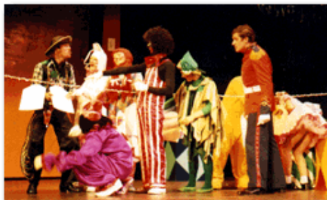
TOYS staged by Ozrij 1977

Groups staging a FOX PLAYS show receive support in the form of free production notes (set-design, costumes, lighting, props, etc) and with musicals, a free set of all the lyrics for chorus members. There is also a video of the show plus some colour photos.